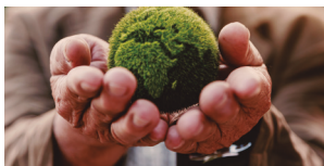
Environment & resource efficiency